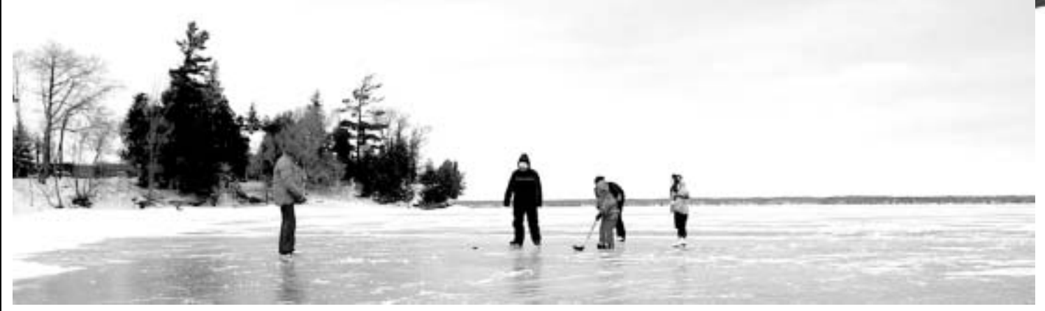
Field of Dreams... Amherst Island Style: Skating on Stella Bay, off the Neilson Store dock, January 18, 2003.