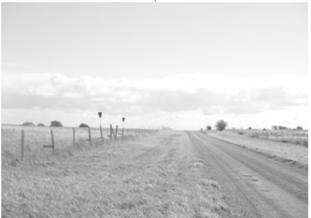
Along the lower forty foot